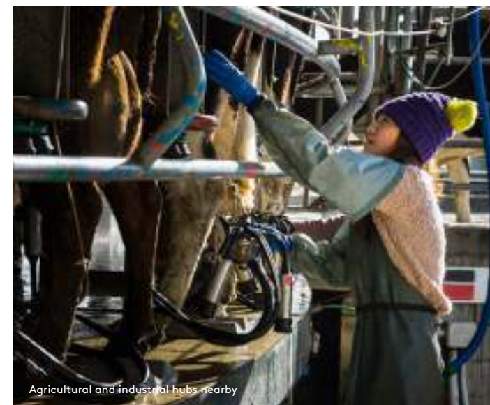
Agricultural and industrial hubs nearby