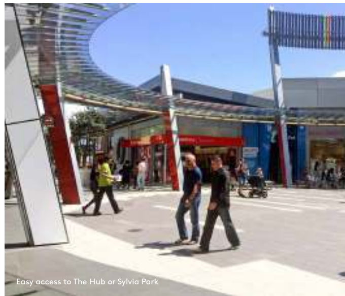
Easy access to The Hub or Sylvia Park

The town is serviced by a newly-built highway interchange leading from the country's main artery, SH1.