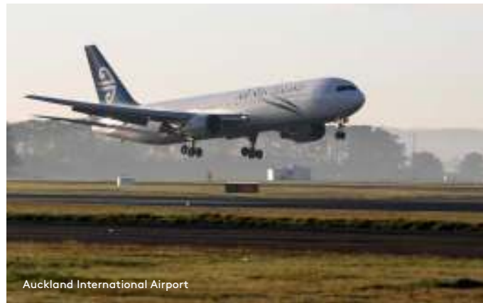
Auckland International Airport