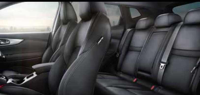
PART GRAPHITE CLOTH/PART LEATHER-ACCENTED* SEAT TRIM