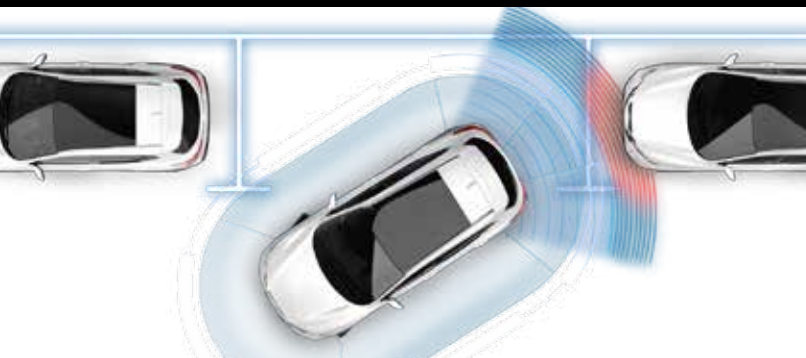
INTELLIGENT PARK ASSIST