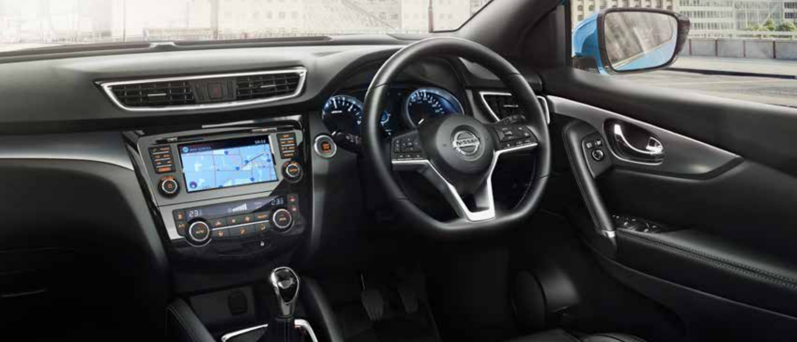
N-TEC INTERIOR SHOWN