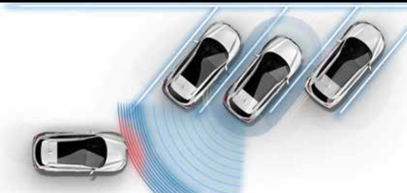
REAR CROSS TRAFFIC ALERT