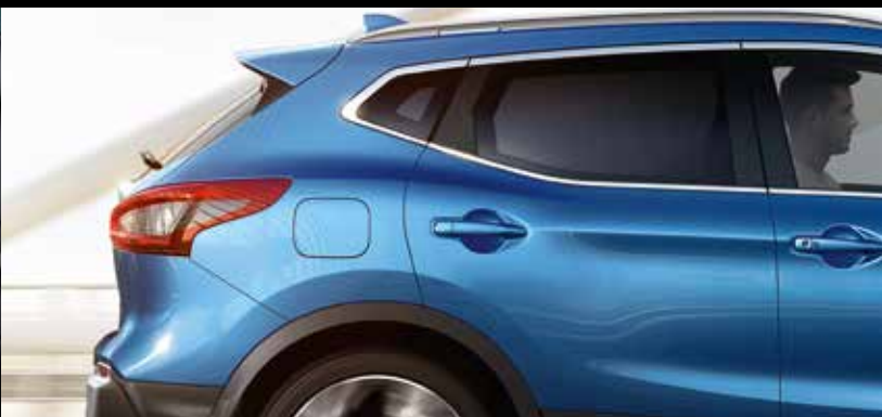
PRIVACY GLASS (2ND ROW AND REAR)