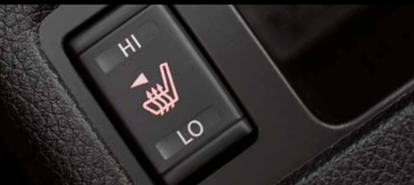
HEATED FRONT SEATS