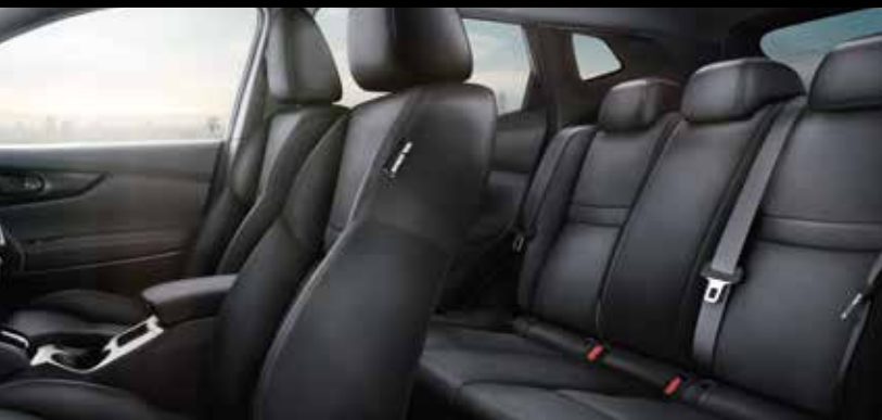
GRAPHITE CLOTH TRIM