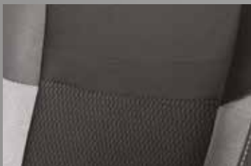
Graphite cloth seat trim. Available on ST only.