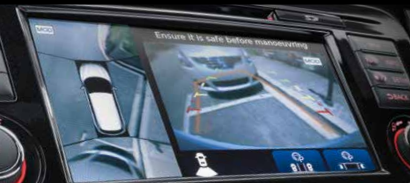
INTELLIGENT AROUND VIEW® MONITOR