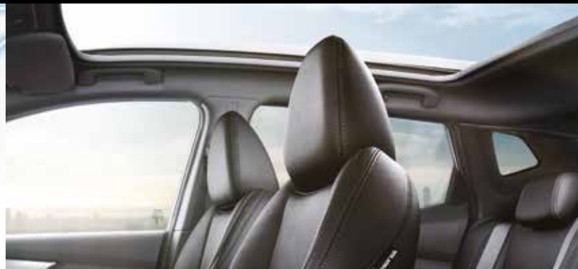
PANORAMIC GLASS ROOF