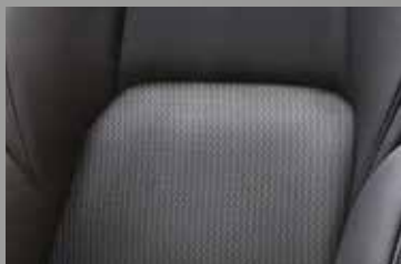
Part graphite cloth/part leather-accented + seat trim. Available on ST-L and N-TEC only.

Minor trim variations may occur from time to time. + Leather-accented features and upholstery may contain synthetic material.