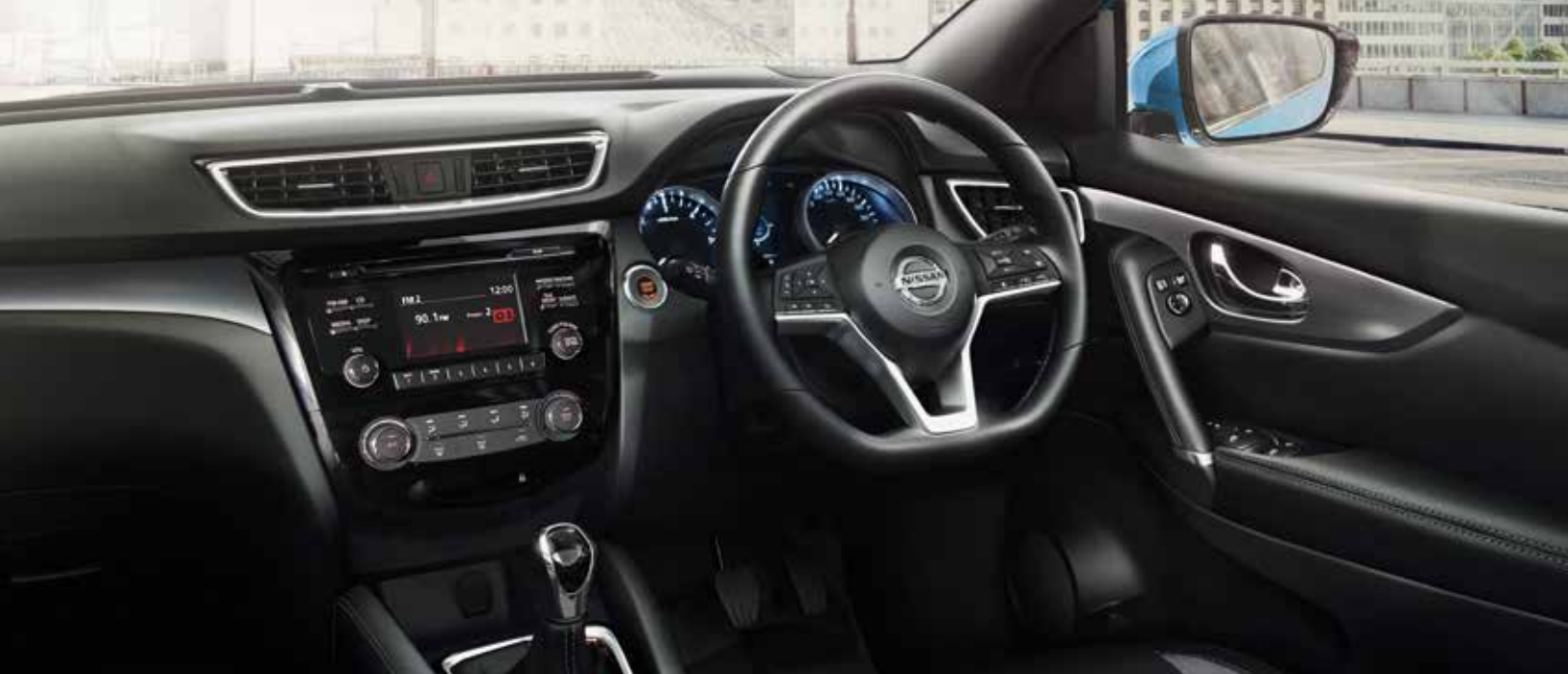
ST INTERIOR SHOWN